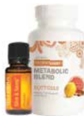
DETOX & SHED

Slim & Sassy Softgel(s) or 3-5 drops in water